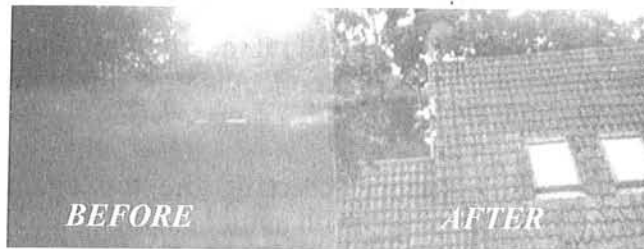
Several products available at auto supply stores, Target or Walmart will reduce the cloudiness of the plastic windows.