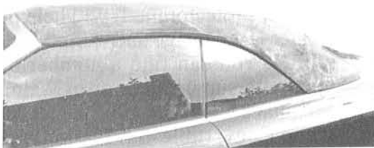
A vinyl top, whether it's on a convertible or hardtop, is prone to fading and discoloring, and will eventually crack if not cared for.

The vinyl is relatively easy to care for. On a regular basis, at least twice a year, raise the top