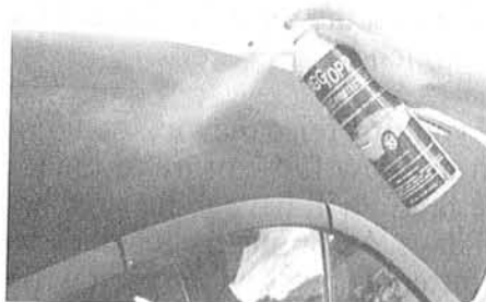
After washing the top, and letting it dry completely, apply a good top protectorant. RaggTopp and 303 Fabric Guard are two well known brands. Follow package instructions for best results

Once completely dry – and complete drying is a necessity – treat the top with a good fabric